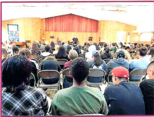
Chapel time with our Teen Week camp speaker