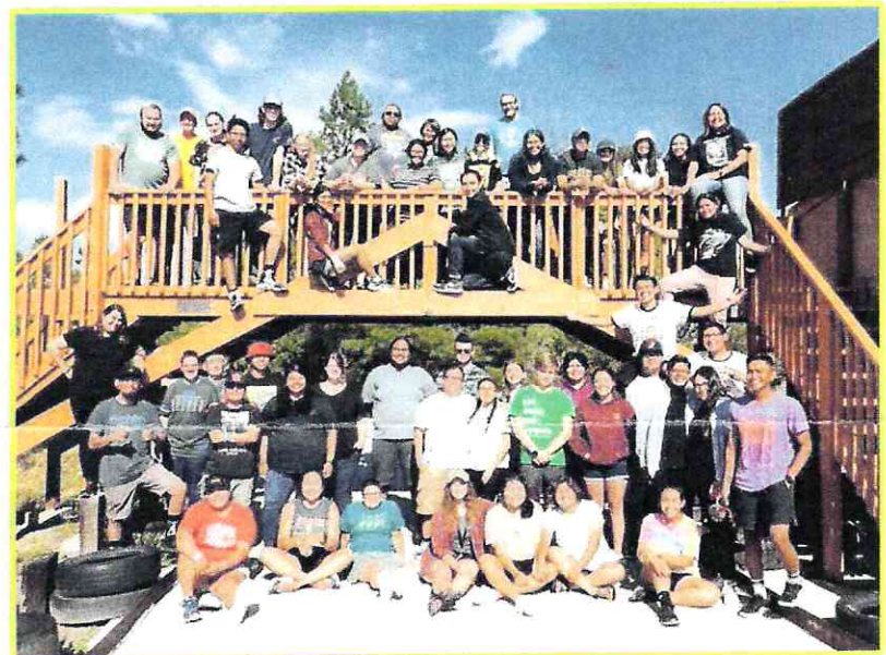
BABR 2021 summer staff

Pray for our 2021 BABR summer staff as they re-enter their lives after such a tremendous time of spiritual growth and victory this summer.